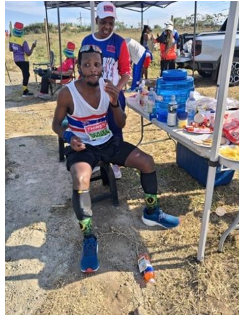
Wiseman taking it easy