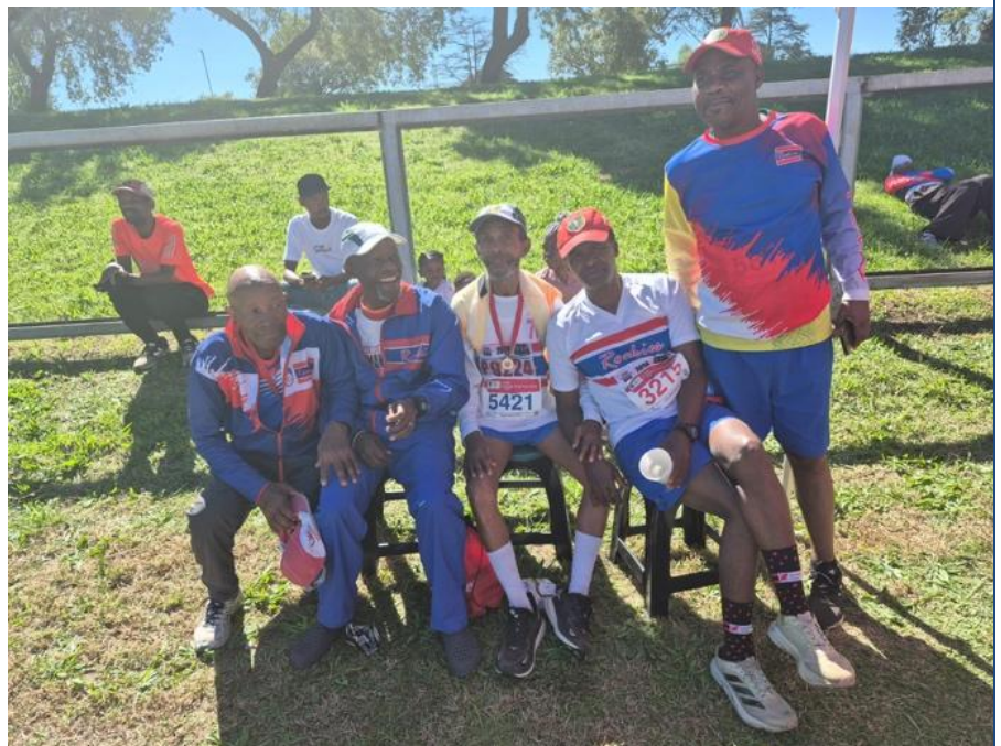
Golden oldies – These guys have approx. 80 Comrades finishes between them