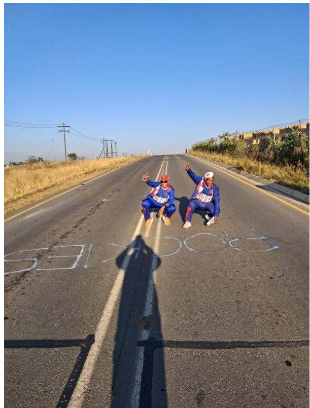
Mavis and Dudu doing a better job at marking the road than JRA