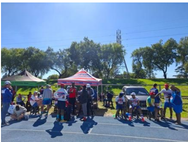
Members enjoying breakfast on a relatively warm day for Colgate